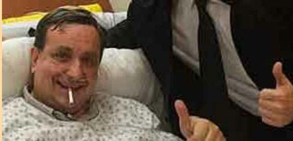
A scene from 'Healthcare Not Fair'