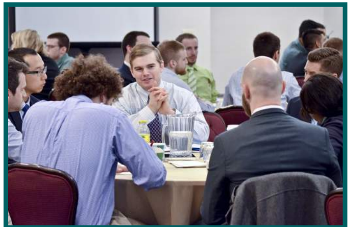
Chapter leaders brainstorm about next year's events at the Leadership Conference.

“ The conference was a terrific experience. I enjoyed it, learned a great deal, and also gained some new perspectives and ideas to bring back to my medical school. Thank you for everything. ”